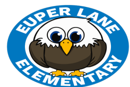
Stretching logo out of proportion