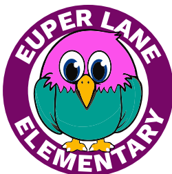
Alteration of logo color outside the palette