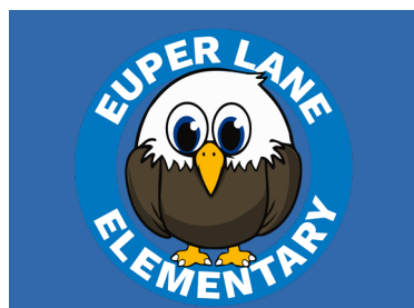
Placement of logo on backgrounds that impact visibility